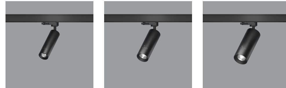
FEEL Zoom 45 32.04521 FEEL Zoom 55 32.05517 FEEL Zoom 65 32.06513